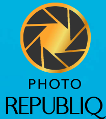
F.A.Q's